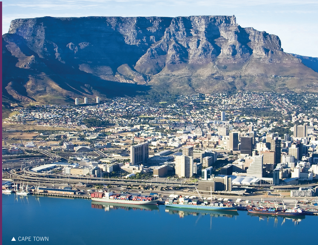
▲ CAPE TOWN