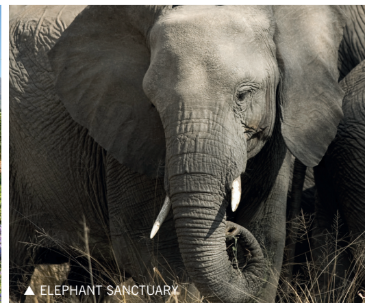
▲ ELEPHANT SANCTUARY