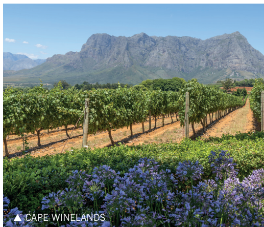
▲ CAPE WINELANDS